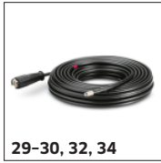
29-30, 32, 34