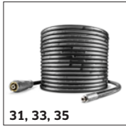
31, 33, 35