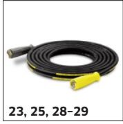
23, 25, 28-29