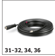
31-32, 34, 36