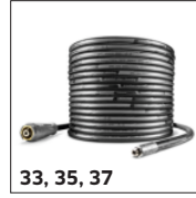
33, 35, 37